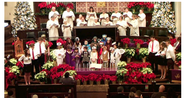
Youth and Children’s Christmas Program