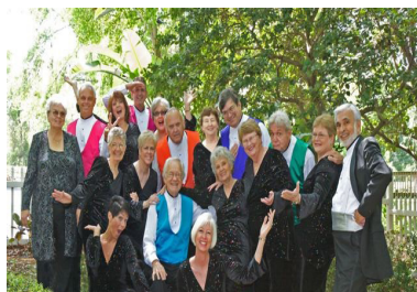
Choral Essence Concert 2010/2011

All are welcome at our regular Sunday worship at 10:30 am. To learn about this historic church and its many other activities and missions, visit our website at www.PeaceMemorial.org .