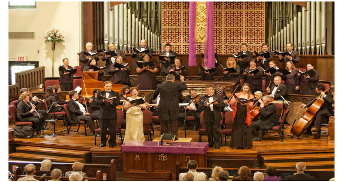
Handel’s Messiah Concert 2011